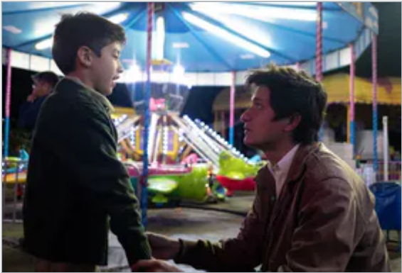
I Carry You With Me tells a busy story about immigration, homosexuality and good food