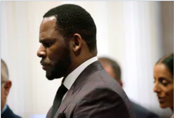
Timeline: A timeline of R. Kelly's life and the sex abuse case against him