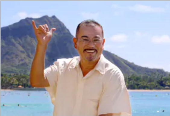
Japan action star Sonny Chiba dies from COVID-19 complications, NHK says