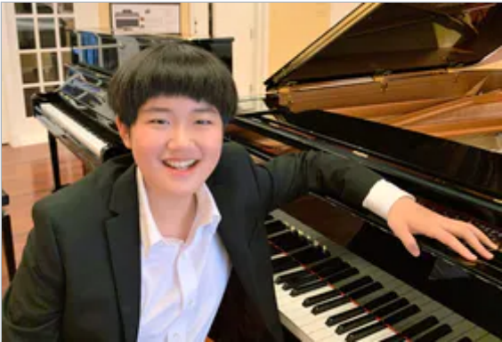
Piano phenom to perform in Tatamagouche Aug. 20